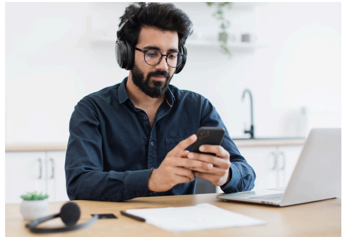
Using phones/books during the test