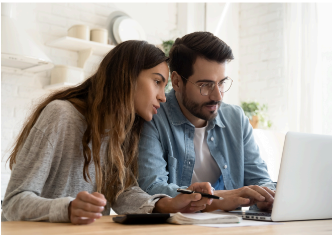
Multiple people in candidate vicinity