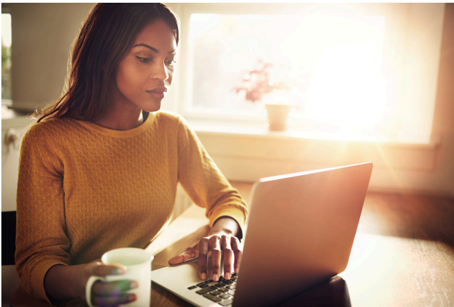
Extremely bright light in the background